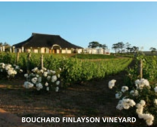
BOUCHARD FINLAYSON VINEYARD